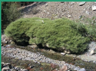
Genista fasselata var. crudelis - Dwarf gorse