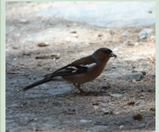
Fringilla coelebs -Chaffinch