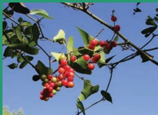
Smilax aspera -Prickly ivy