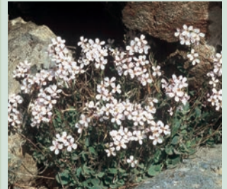
Arabis purpurea -Rockcress