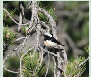
Oenanthe cyprica -Cyprus wheatear