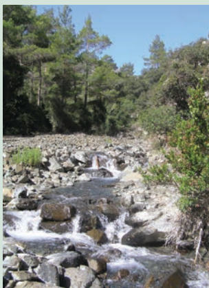
Loumata ton Aeton trail

The route traverses a beautiful hillside of dense forest, ending in Loumata ton Aeton River , which has significant water flow even in the summer. From there the trail follows a course along the riverbank and ends up at a village road, near the Amiantos community park . The largest part of the trail was an older route that the Amiantos asbestos mine workers used to use. The route is linear, but could become circular if you follow the road through the village, toward the SEK camping site. The trail is part of Troodos National Forest Park, which is a Natura 2000 site.